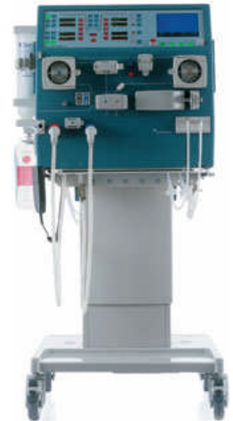
Gambro AK200S Similar to the new machines at the dialysis centres

On the positive side, the new technology, once mastered, should provide some advances and the opportunity to improve the treatment provided to patients. That's worth putting effort into and something for us to look forward to.