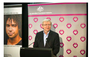
Prime Minister launching the Donatelif e Campaign.

Many Australians are not aware that in Australia the family's consent to organ and tissue