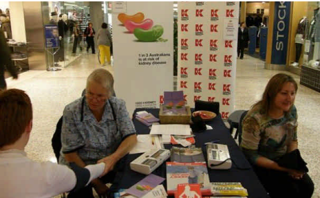
Taking blood pressure in Woden.

The Canberra Times and WIN News provided good coverage of the event. This coverage has created greater awareness of renal health issues in the community and hopefully will lead to some of those people at risk of going on to develop renal problems taking some action now, before it is too late.