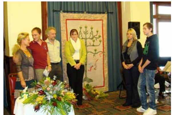
Kate Lundy with donor families and quilt at the thanksgiving service